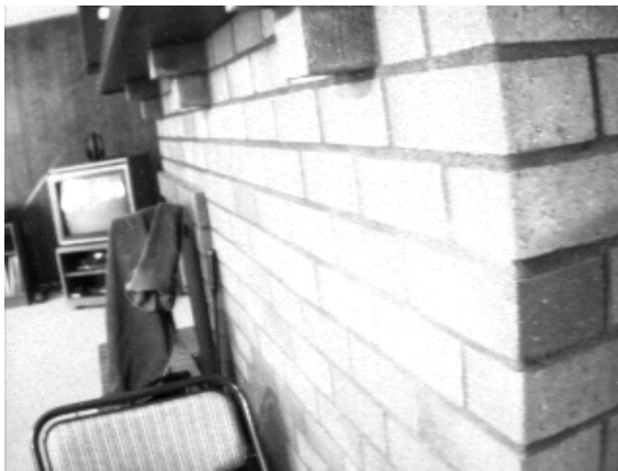
Figure 1. Input Image a

The IA DSL is the basis of the Implementation Neutral Specification (INS) in the examples used throughout the remainder of this document. A full description of the IA used by DSLGen™ is beyond the scope of this paper (see [9]) but a few comments are in order. The IA is much like APL in the sense that IA specifications eschew the use of explicit looping constructs allowing loops to be implied by IA operators and data structures. The generator will introduce implied loops as constraints and, through the manipulation, combination and propagation of these constraints, will determine the relationships between IA expressions and loops. The initial form of the LA arises during this process.